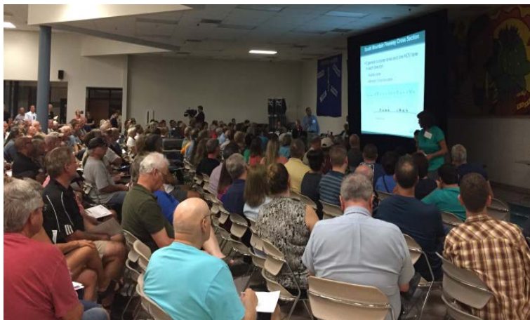
Desert Vista High School presentation.

During the presentation, residents were encouraged to write their questions on cards and give them to staff. The question cards were collected and grouped by category.