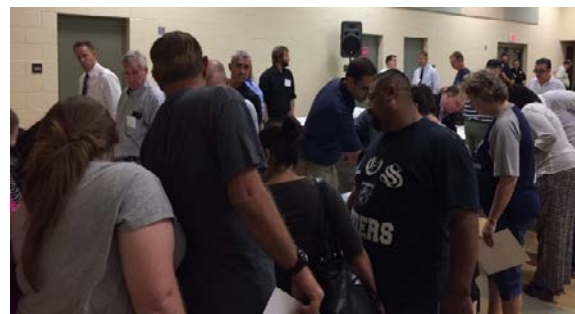
Fowler Elementary attendees view preliminary design plans.

Decision makers at ADOT, Federal Highway Administration (FHWA) and Maricopa Association of Governments (MAG) are currently reviewing the preliminary design comments and will be determining which changes should be included in the final design. The public will be given an update as soon as the decisions are made.