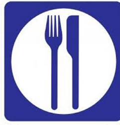
Food available ahead