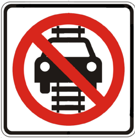
No driving on railroad tracks