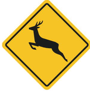
Watch for deer crossing