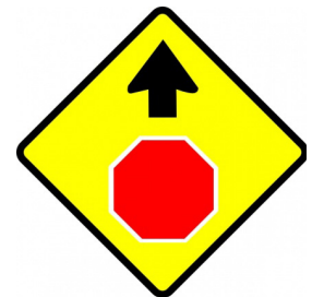
Stop sign ahead