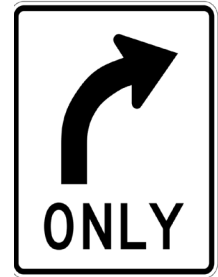
Right turn only ahead